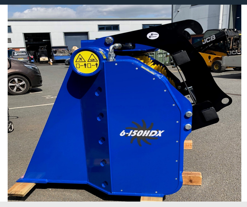
CarriersVFor 16 - 20 ton excavators1